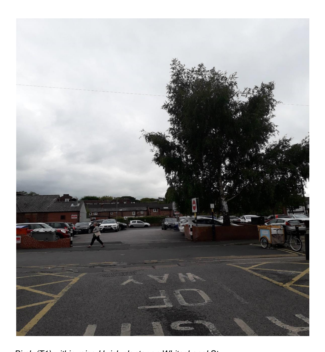
Birch (T1) within raised brick planter on Whitechapel St

The committee is asked to consider 1 objection made to this order relating to a Tree Preservation Order (TPO) served at the above address on 1 Birch tree (T1) and 6 Callery Pear trees (T3 – T8) immediately adjacent to a car park on York Street, Didsbury, Manchester, M20 6UE.