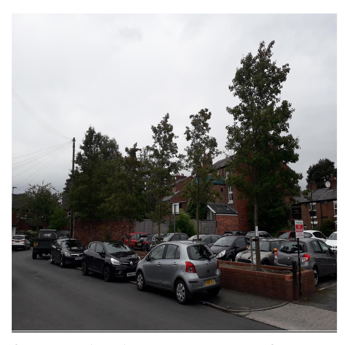
Callery Pear trees (T3 – T8) within raised brick planter on York Street